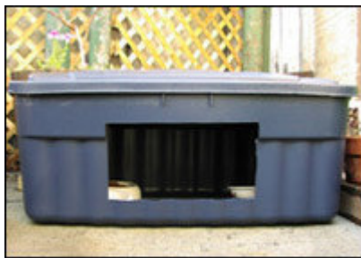
Rubbermaid storage bin converted into covered feeding station

If you are going on vacation and need assistance feeding your cats during your absence or can't find someone to feed the cats, request assistance on our electronic distribution list at feral@indyferal.org , contact your Cat Captain, or call 317-596-2300.